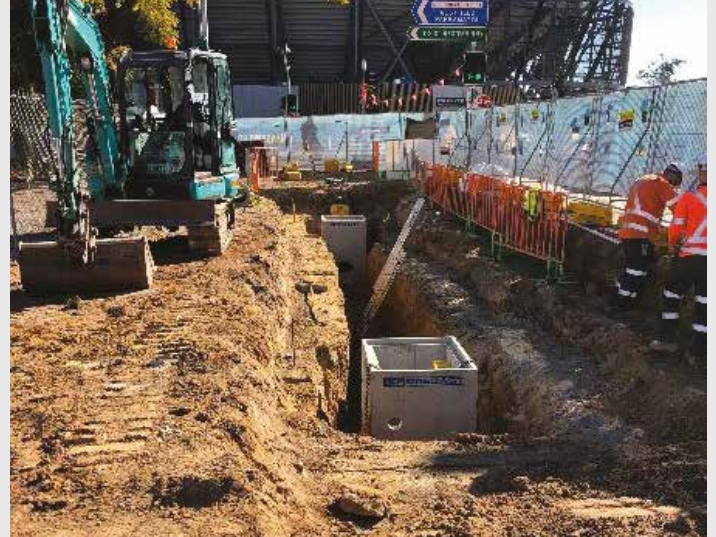
Above: underground utilities investigations in North Parramatta as part of the Parramatta Light Rail ‘enabling’ road works.