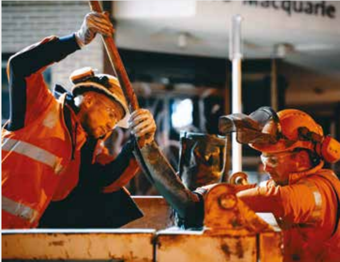
Above: a crew from Parramatta Light Rail delivery partners CPB Downer Joint Venture undertakes site investigation works in Parramatta.

In North Parramatta and around the CBD, road works are ongoing to update local area traffic networks in readiness for Parramatta Light Rail construction. ‘Enabling works’ is the term used for construction works such as the relocation of underground utilities, the modification or installation of traffic lights, road widening, the redirection of traffic flows and changes to parking. Most of the Parramatta Light Rail enabling works are intended to upgrade roads and increase road capacity to make it easier for traffic to move in and around the Parramatta area. Find out more about where we will be each week at www.parramattalightrail.nsw.gov.au/weekly-works .